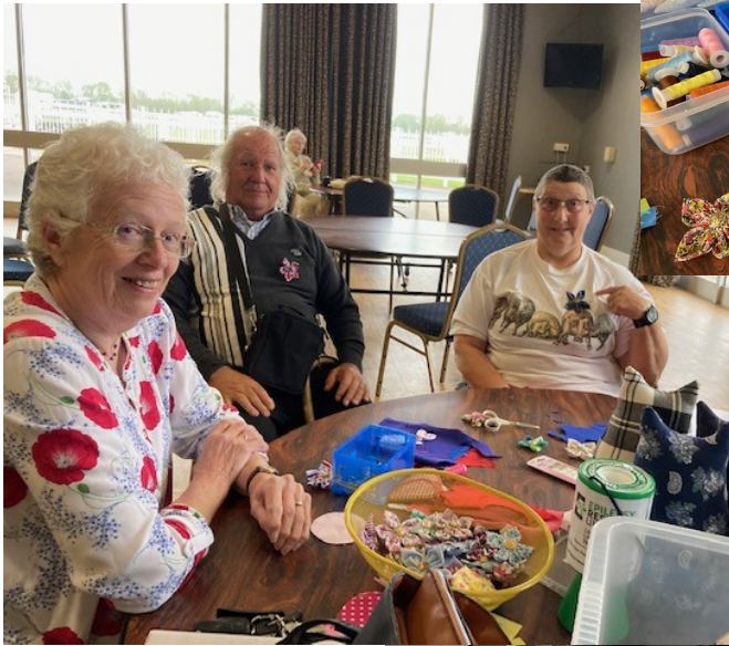
The Romaclub rallies are not just enjoying meeting friends.