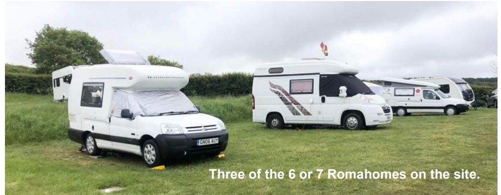
Three of the 6 or 7 Romahomes on the site.

It was a nice site with Cromer and East Runton within walking distance where there are plenty of shops, restaurants etc. It had nice new and clean toilet blocks and being a massive farm, plenty of walks to keep you fit. The site has a Thai food trailer which we sampled (would be rude not to) and I we saw some people waiting . absolutely freezing and the woman in front of us had sandals on and her feet were blue! Back at the van it was nice to use the diesel heater which hasn't been used much.